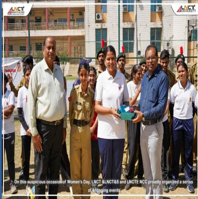
On this auspicious occasion of Women's Day, LNCT & LNCT&S and LNCTE NCC proudly organized a series of engaging events

On 08th March 2025, The NCC LNCT Bhopal celebrated International Women's Day by engaging with women in authority and learning from their inspirational journeys. They also participated in a women's empowerment quiz that highlighted the achievements of pioneering women and important gender equality laws. These events fostered learning, dialogue, and appreciation for women's contributions, motivating the cadets to strive for excellence and advocate for women's rights. The day concluded with a spirited volleyball match, reflecting teamwork and enthusiasm among the Senior Wing Students.