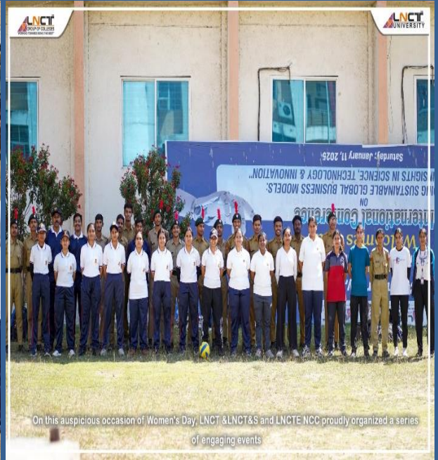
On this auspicious occasion of Women's Day, LNCT & LNCT&S and LNCTE NCC proudly organized a series of engaging events

On 7th May 2025, NCC LNCT cadets took part in the nationwide Civil Defiance mock drill, participating in blackout simulations, evacuation rehearsals, and safety demonstrations. Their efforts helped test emergency protocols, raise disaster preparedness awareness, and strengthen local response capabilities.